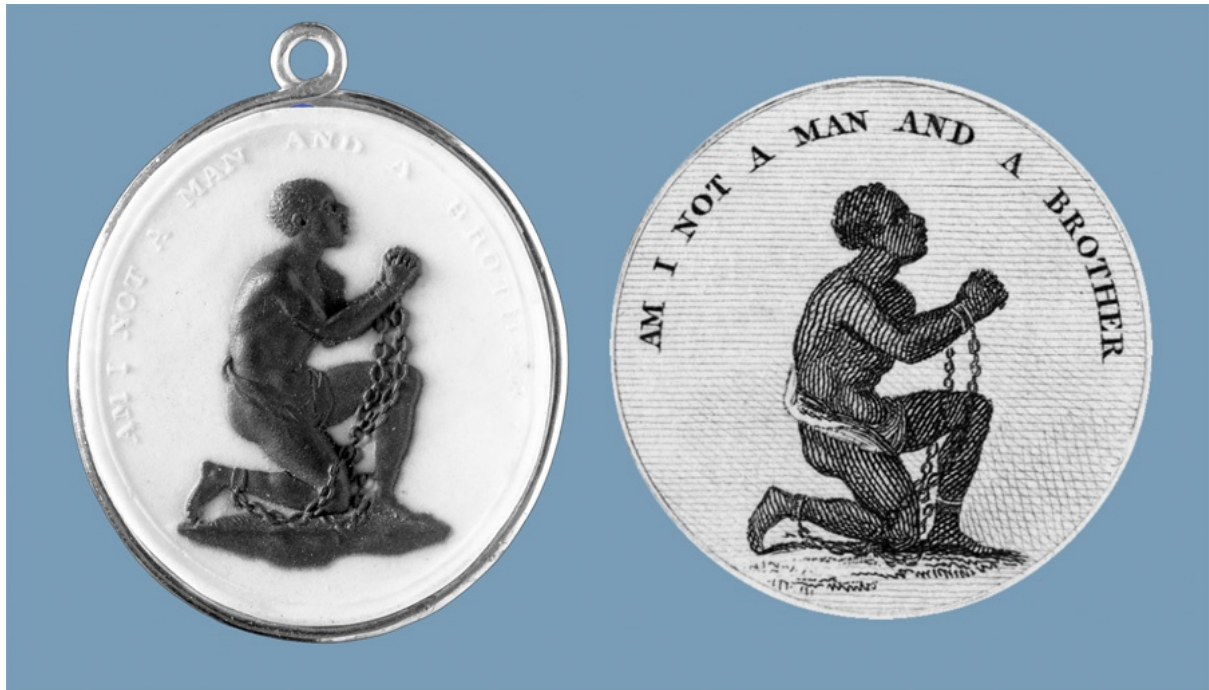
Josiah Wedgwood's Anti Slavery medallion. 1787

The Abolitionist campaign was spearheaded by William Wilberforce and supported by influential men like Josiah Wedgwood who produced a medallion with the famous slogan, 'Am I not a Man and a Brother?' The Quakers were also involved. It was a long campaign. The British Slave Trade was abolished in 1807 but slavery itself continued in the colonies and it was not until 1833 that Parliament abolished Slavery.