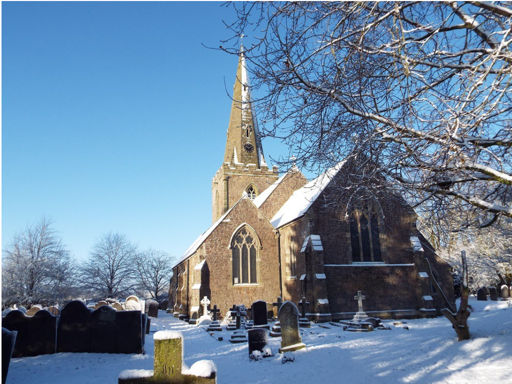
Gilmorton Church – Colin Beadle